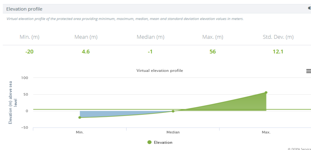
Figure 2. Virtual elevation profile for the coastal protected area of Banc d'Arguin National Park, Mauritania). Topography below sea level is highlighted in blue.

The presentation of a virtual elevation profile of the protected area (Figure 2) will further help to assess the variability of the environment because monthly climate statistics might not be representative of the full spectrum of climatic parameters in the case of very large areas or for areas presenting complex topology such a mountainous or coastal areas.